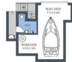
WATER FRONT LEVEL